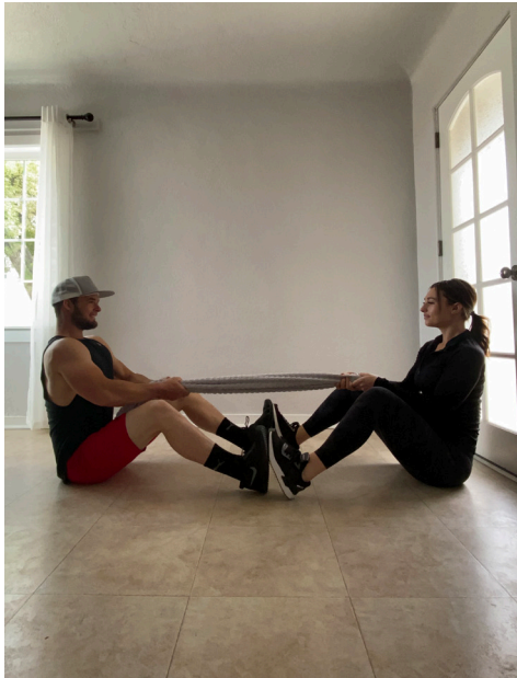
“Seated Buddy Lat Pull” Upper Back Exercise 2