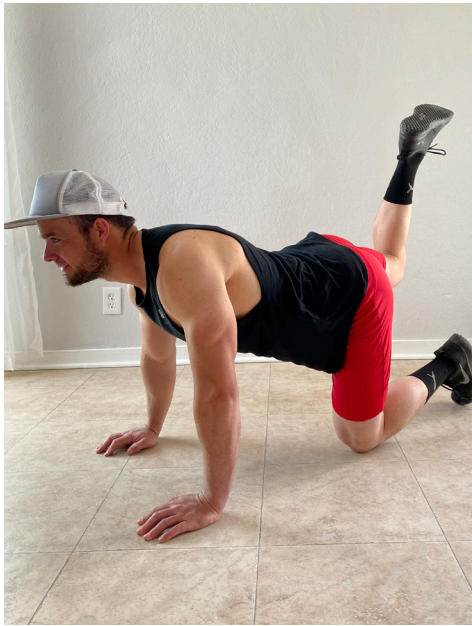
“Leg Lift” Glute Exercise