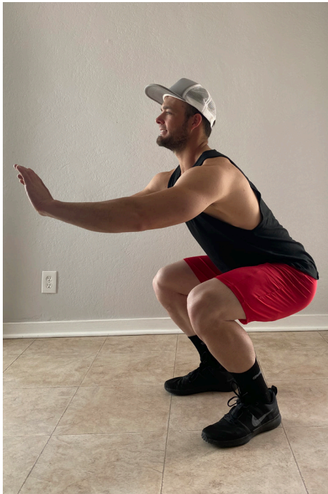
“Squat” Quadriceps Exercise