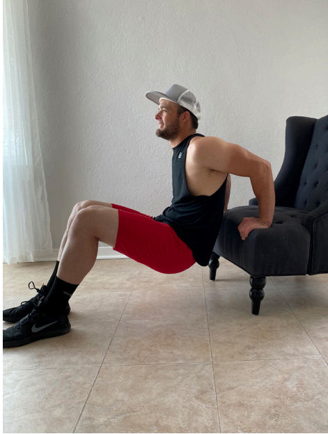
“Chair Dip” Tricep Exercise