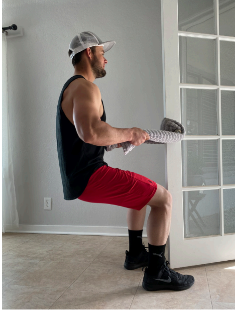
“Door Row” Upper Back Exercise 1