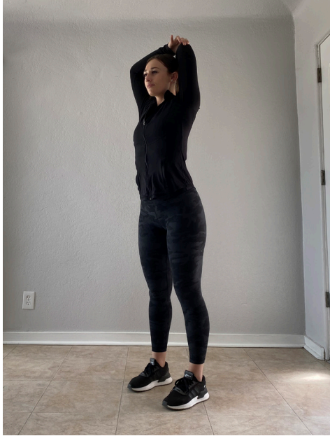
Lat and Bicep Stretch