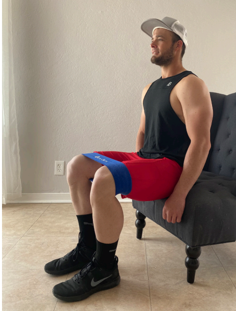
Outer Thigh Exercise