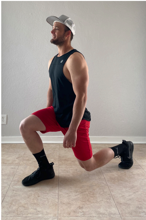
“Lunge” Hamstring Exercise