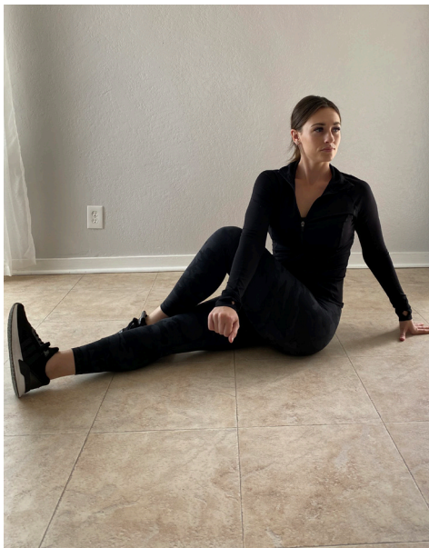
Lateral Hip Stretch