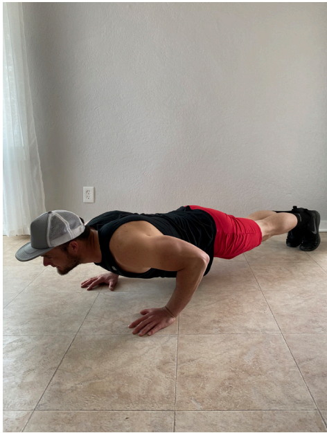
“Push Up” Chest Exercise