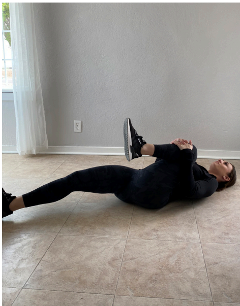
“Single Knee To Chest” Glute Stretch

Repeat for 10-12 repetitions with each leg.