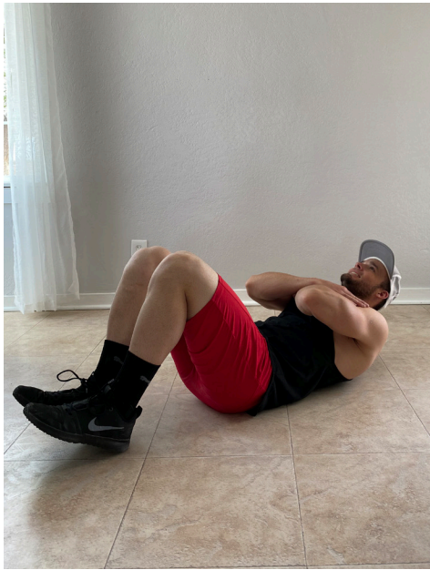
“Crunches” Abdominal Exercise