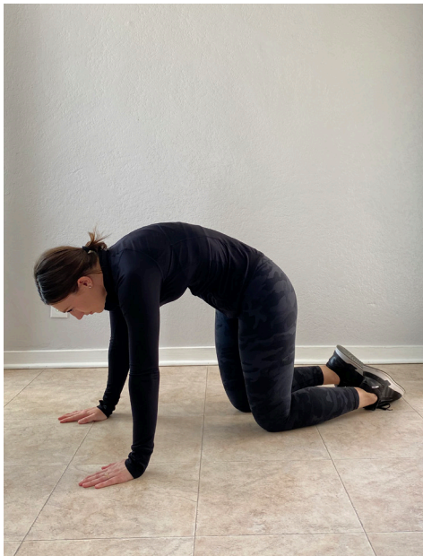
Abdominal and Back Stretch