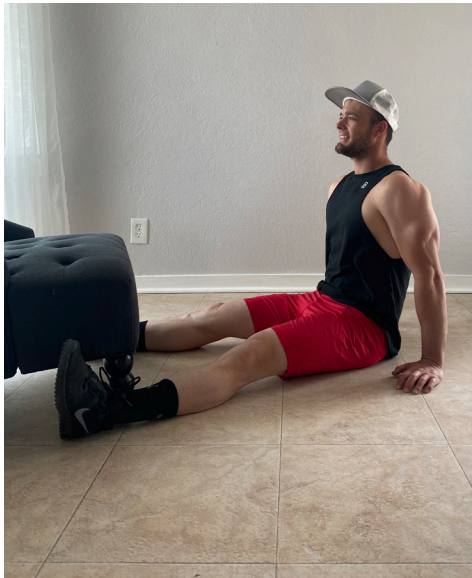
Inner Thigh Exercise