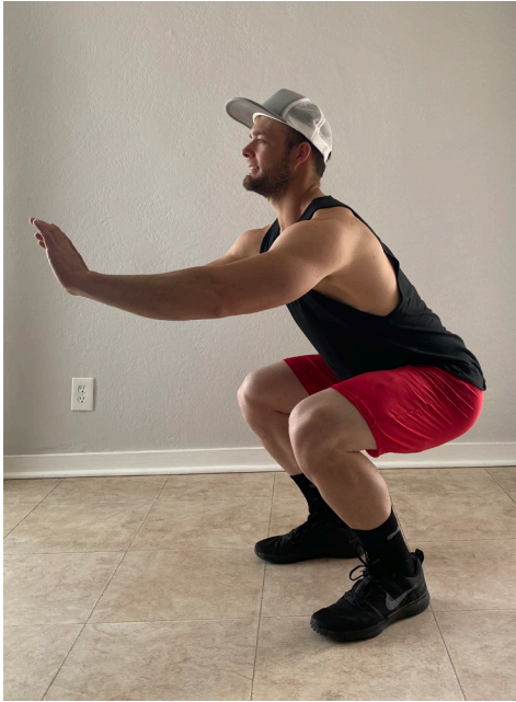
“Squat” Full Body Warmup